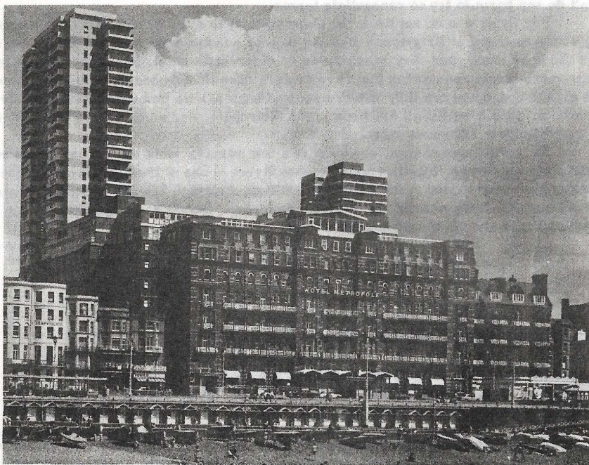
The Metropole Hotel, Brighton